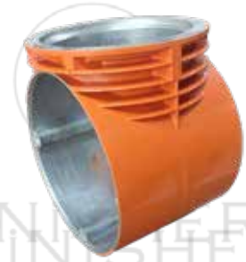
IS MAKINELERİ IS MAKINELERİ

KOMPRESÖR 230V AIR COMPRESSOR 230V 4.5 BAR, 230V, SINGLE PHASE,MADE IN TURKEY