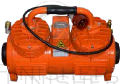
IS MAKINELERİ IS MAKINELERİ

SU POMPASI 0.5 HP MONO WATER PUMP SMT5 MONO